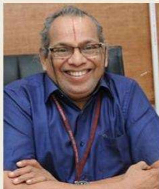
Padma Shri Prof R Vasudevan

In 2002, Professor Vasudevan came up with the idea of spraying dry, shredded plastic waste, made up of pieces as small as 2 mm in size, over gravel or bitumen heated to 170 degrees Celsius. The plastic melted and coated the stones with a thin film. The plastic-coated stones were then added to molten tar. Since both plastic and tar are petroleum products, they bind well. Vasudevan first tried out this technique to pave a road on the college campus. It yielded twin benefits: it reused plastic waste and built durable roads.